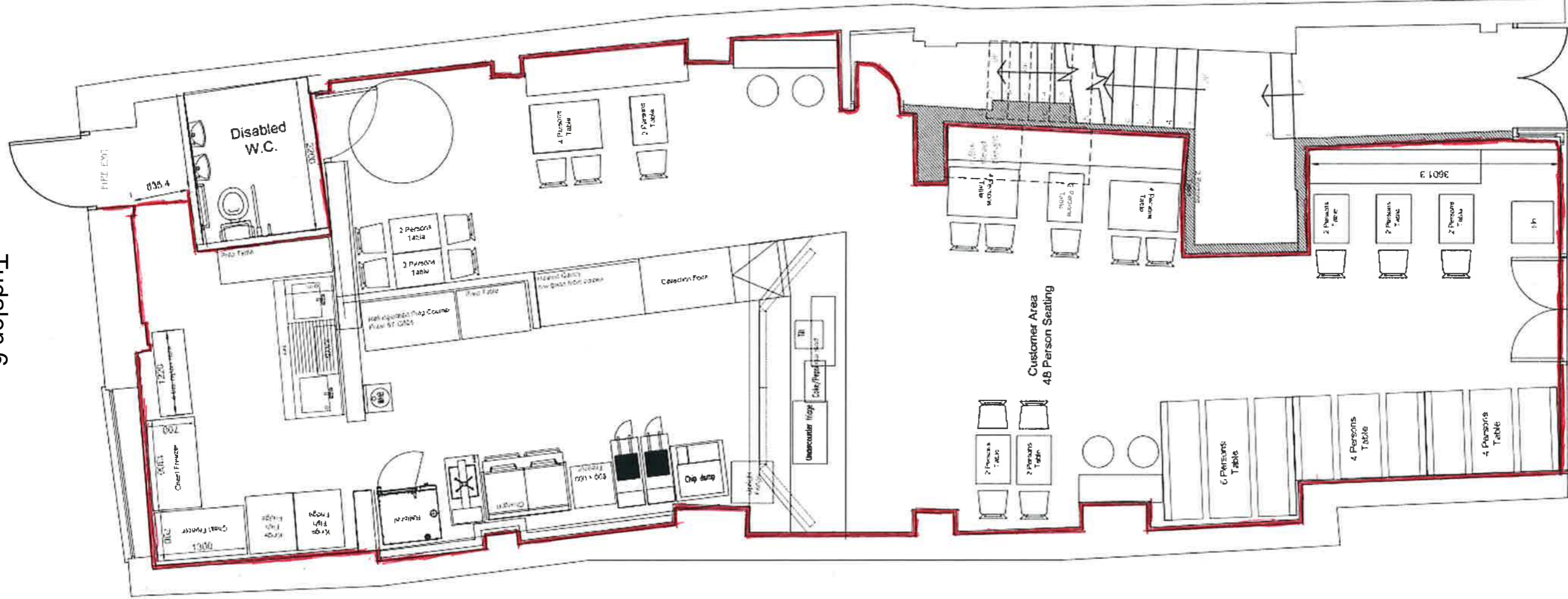
PROPOSED GROUND FLOOR LAYOUT